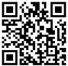
How it works

For more information, please visit: http://www.secuxtech.com/howitworks/ or scan the QR code. You can also email support@secuxtech.com